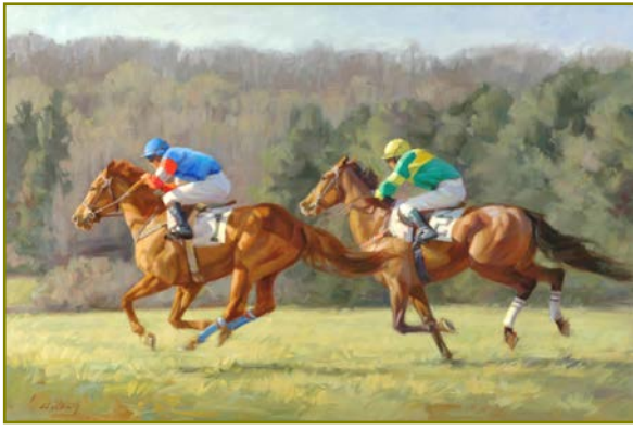
Only Two In It by Linda Volrath, oil, 20 x 30 inches