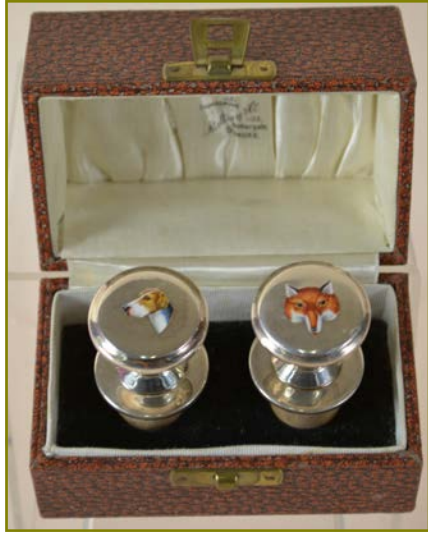
Pair of Sterling Silver Bottle Stoppers w/ Fox & Hound Head Enamels, Birmingham, 1933, w/ original case, Rattray & Co., Dundee, 2.5" h x 1.25" w