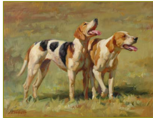
Their Master's Voice by Linda Volrath (American contemporary), oil, 11" x 14"