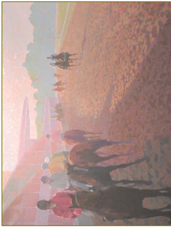
Keeneland Impressions by Peter Howell, (English contemporary) oil, 28 x 36 inches